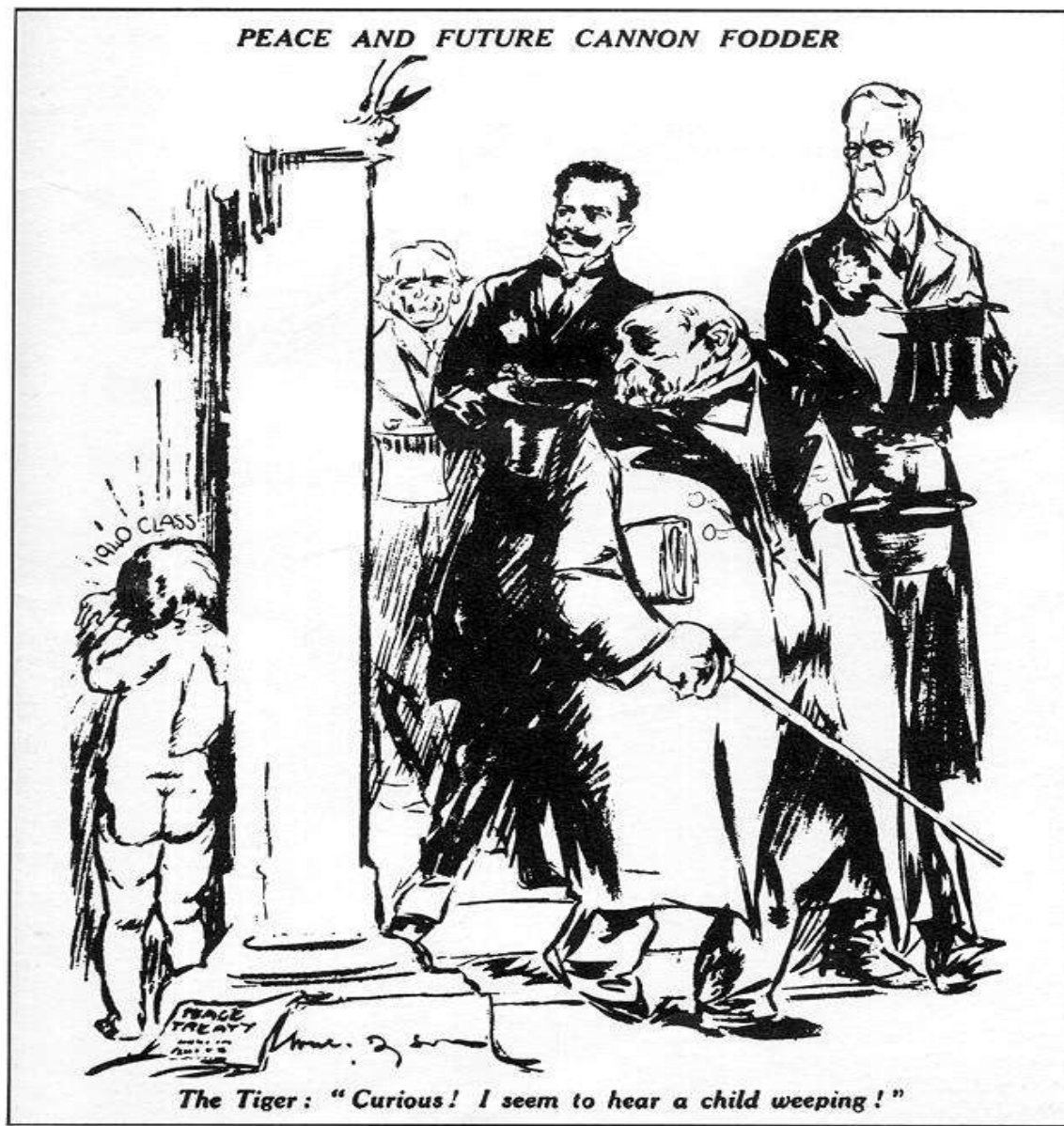
The Tiger: "Curious! I seem to hear a child weeping!"