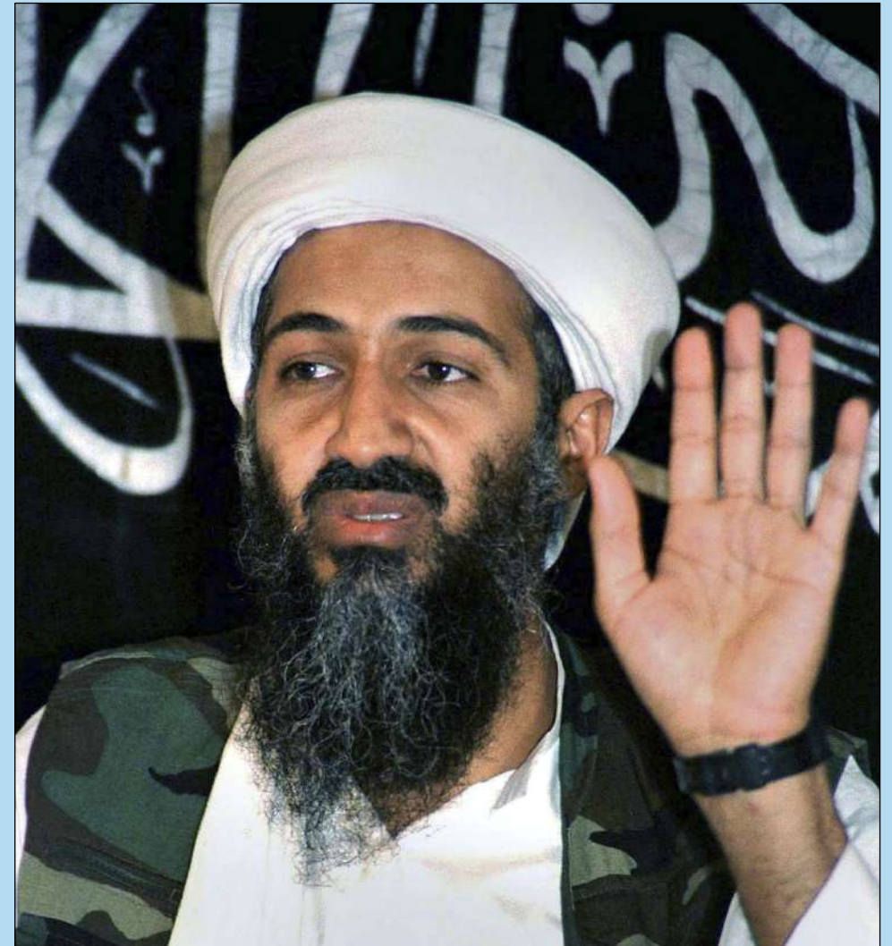
Osama bin Laden