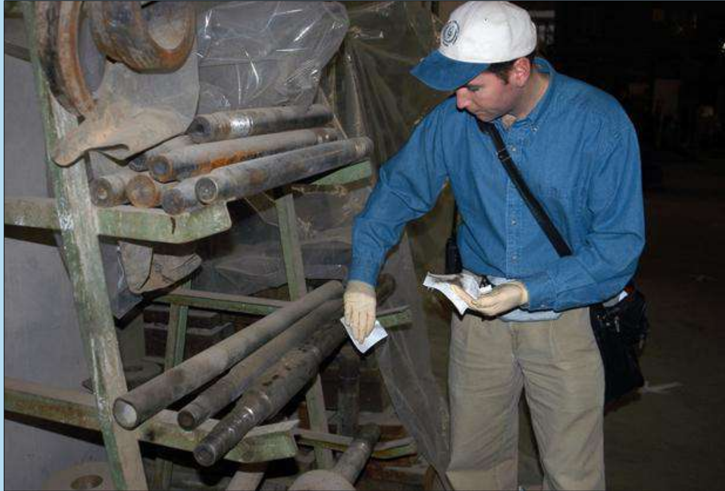
UN weapons inspector taking samples at an Iraqi factory in 2002.