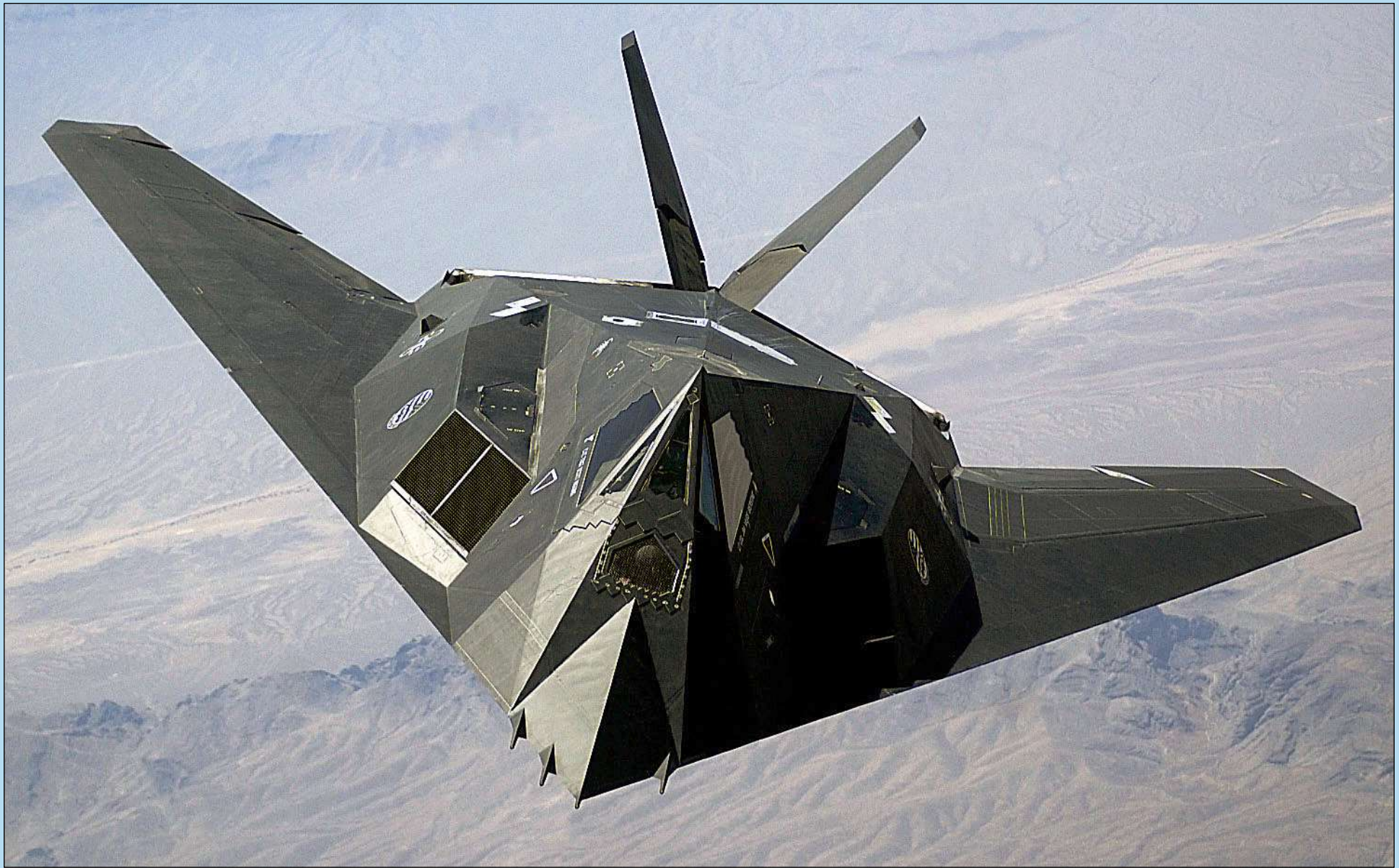
A US Nighthawk – one of the key players in Desert Storm.