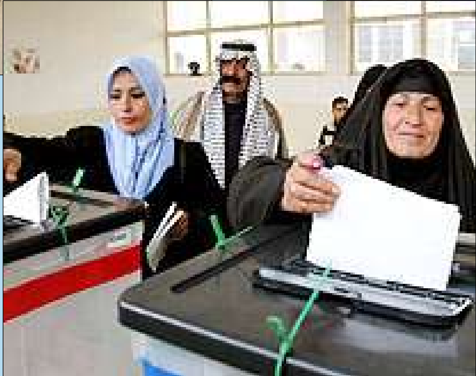
2005 Iraqi Elections