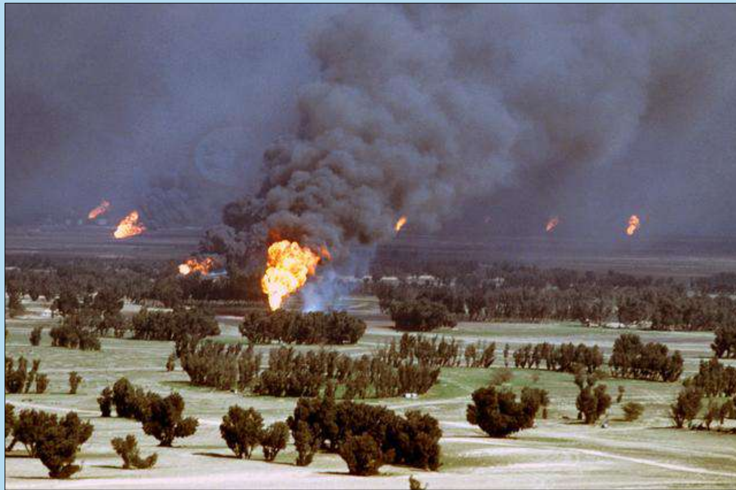
Oil fires set in Kuwait by Iraqi forces.