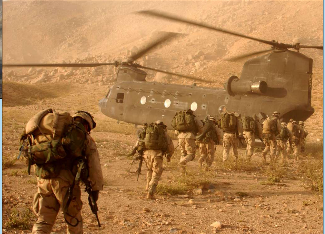
U.S. troops in Afghanistan in 2001.