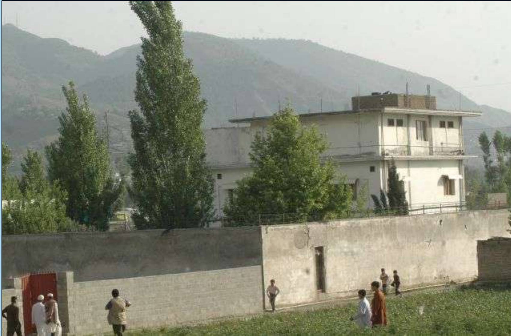
Osama bin Laden's compound in Pakistan where he was found in 2011.