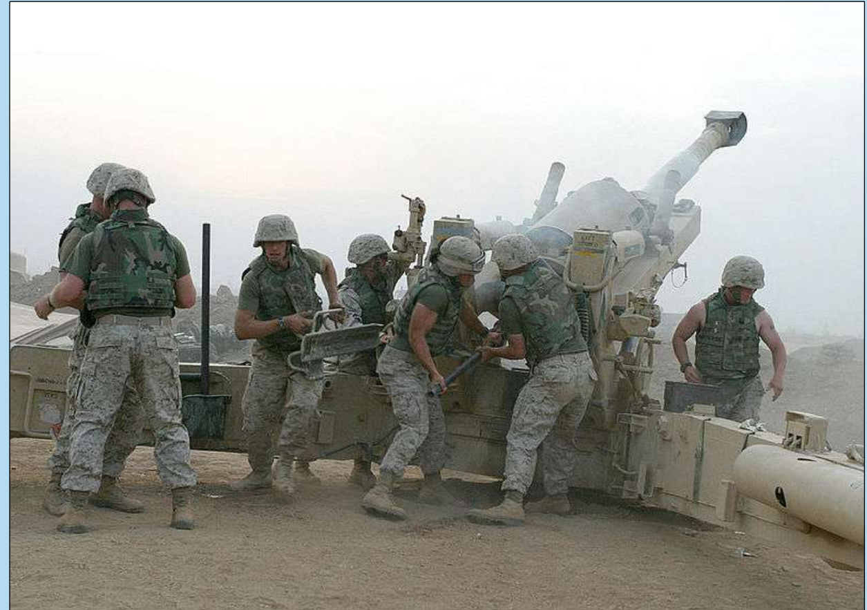
U.S. marines fire a M198 Medium Howitzer.