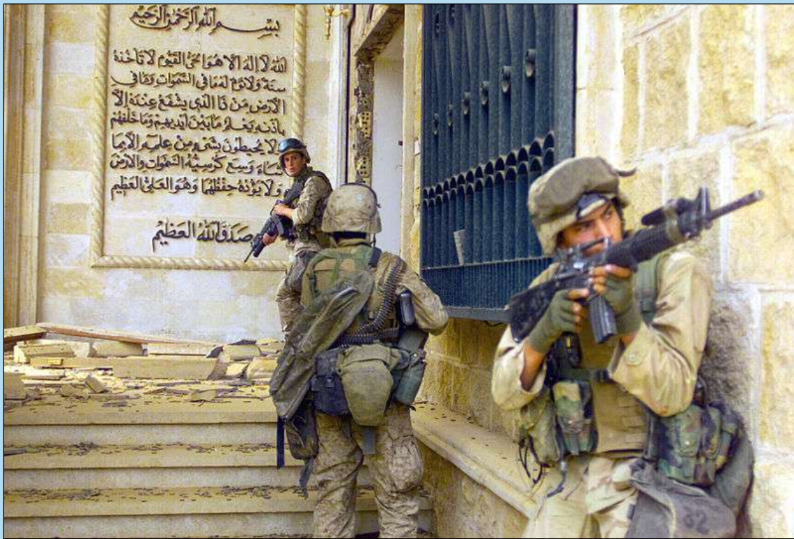
U.S. marines enter a palace in Baghdad.