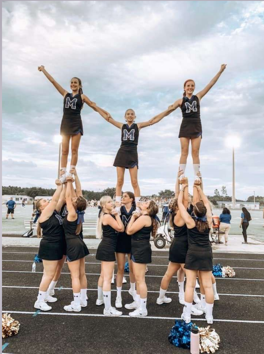
JV Sideline Football