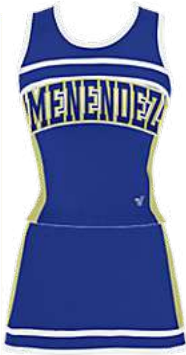
Varsity New Blue