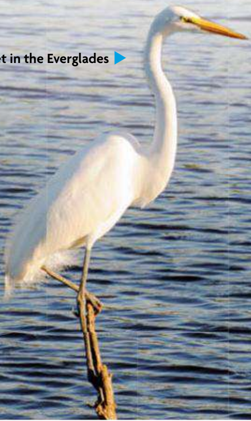
An egret in the Everglades

Write a short essay about why tourism is important to our state.