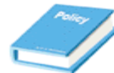
Government policy and EU subsidies