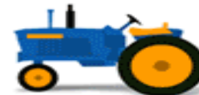
Building machinery labour