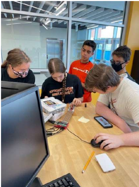
Students creating a temperature sensor-controlled fan

The electives in this academy will emphasize the use of emerging technologies and the leadership, entrepreneurial and technical skills needed to be successful in rapidly changing industries using future technologies. This path provides students with the content and skills essential to the design and operation of robotics, including artificial intelligence, sensors, electronic devices, engineering technologies, motion physics, electrical motors, programming, simulation and modeling and critical thinking skills. Fields related to the design, construction, coding and use of industrial, medical, or commercial robotics will be emphasized. Students will immerse themselves in the use of drones, robotics and design elements/software and equipment related to current industrial, commercial, and medical applications.