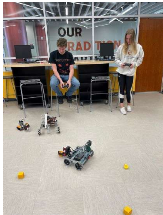
Vex robots in action!