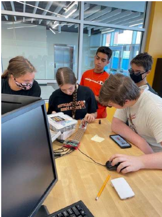
Students creating a temperature sensor-controlled fan

The electives in this academy will emphasize the use of emerging technologies and the leadership, entrepreneurial and technical skills needed to be successful in rapidly changing industries using future technologies. This path provides students with the content and skills essential to the design and operation of robotics, including artificial intelligence, sensors, electronic devices, engineering technologies, motion physics, electrical motors, programming, simulation and modeling and critical thinking skills. Fields related to the design, construction, coding and use of industrial, medical, or commercial robotics will be emphasized. Students will immerse themselves in the use of drones, robotics and design elements/software and equipment related to current industrial, commercial, and medical applications.