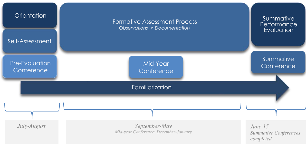
Figure 4: Teacher Assessment on Performance Standards Process Flow

The process by which LEAs shall implement the TAPS portion of the Teacher Keys Effectiveness System is depicted in Figure 4. This flow chart provides broad guidance for the TAPS process, but LEAs should consider developing internal timelines for completion of steps at the LEA and school level.