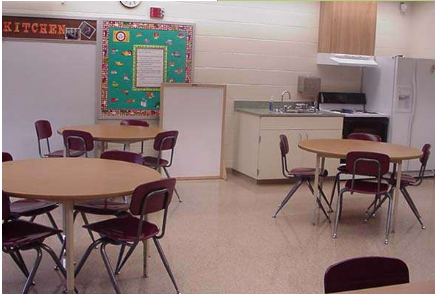
CIS Kitchen – used for classroom cooking activities.