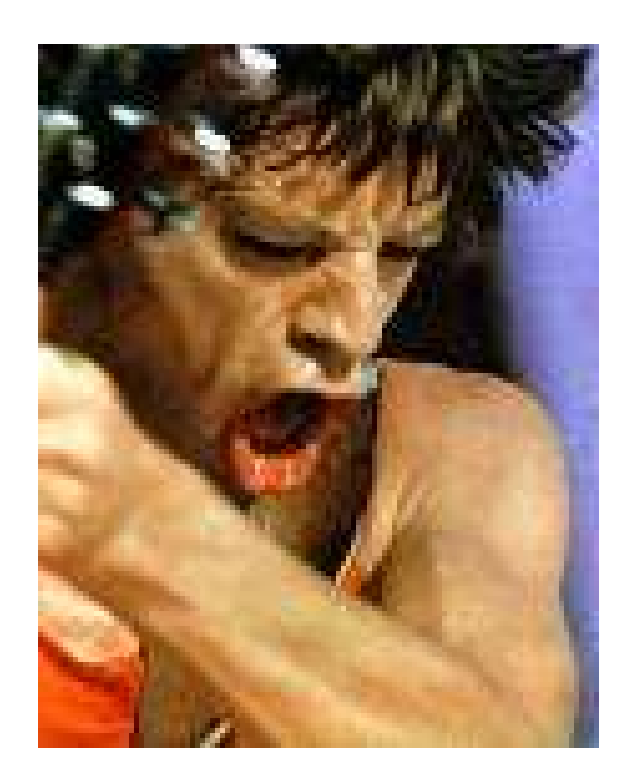
"You can't always get what you want."