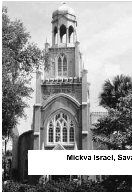
Mickva Israel, Savannah, Georgia

Upon settling in Georgia, the Savannah Jews probably held services in the homes of members. In July 1735 they “met together, and agreed to open a Synagogue...which was done immediately, named K. K. Mickva Israel” (Kahal Kodesh Mickva Israel which is translated as Holy Congregation Hope of Israel).