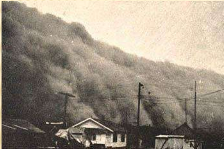
A wall of dust approaches a Kansas town October 4, 1935