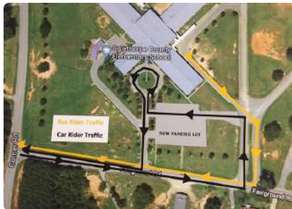
OCES Car Rider Map

Dismissal will run long the first few weeks of school, so please be patient!