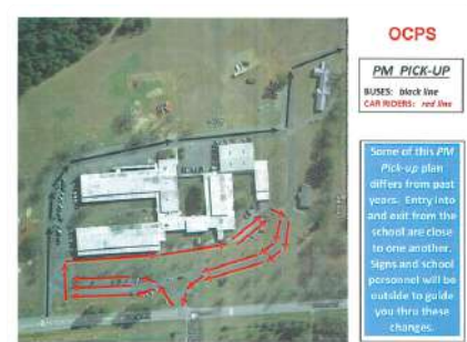
OCPS Afternoon Car Rider Map