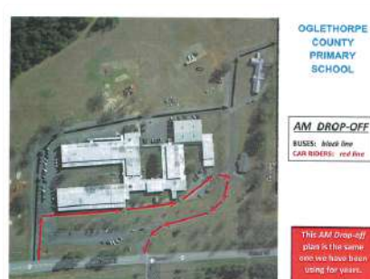
OCPS Morning Car Rider Map