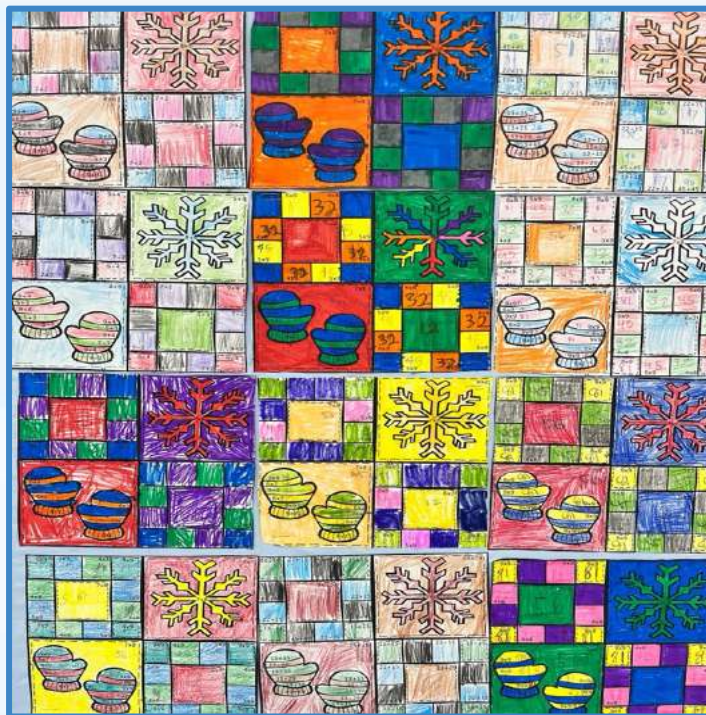
B7 Winter Multiplication Quilt