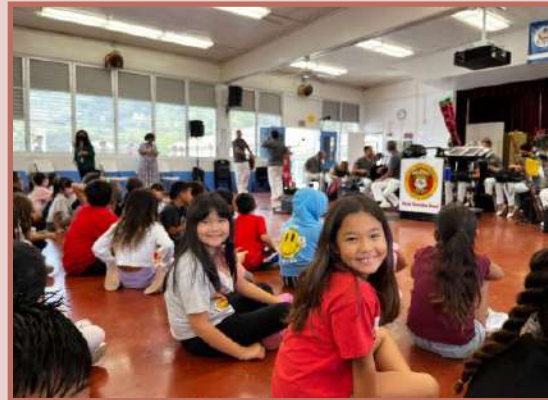
The Royal Hawaiian Band at Pauoa Elementary