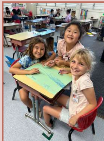
Collaborative Posters! 😊