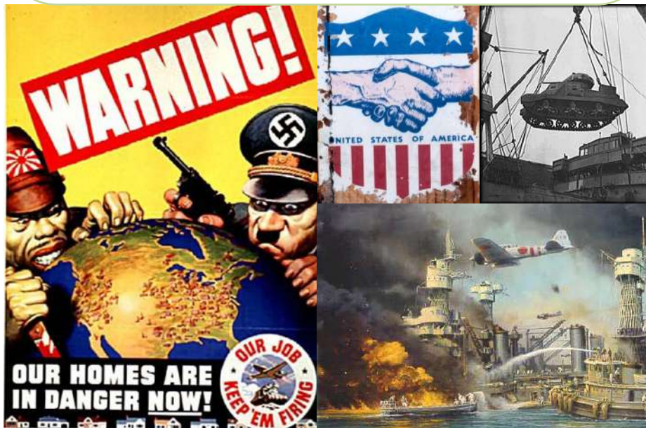
shipyards, Richard Russell, and Carl Vinson.

In 1939, Germany's Adolf Hitler invaded Poland. Great Britain and France then declared war on Germany beginning World War II. The United States did not want to become involved in WWII as the economy was still recovering from the Great Depression. However, there was a growing fear that Germany would conquer Europe, which was a threat to U.S. security. To help out the Allied Powers without sending US troops into battle Franklin D. Roosevelt persuaded Congress to pass the Lend-Lease Act. The purpose of this act was to provide economic and military aid to the Allied Powers (countries fighting against the Axis Powers of Germany, Italy, and Japan) and they would repay America after the war. The United States provided $50 Billion dollars worth of military supplies such as tanks, airplanes, guns, and ammunition, along with foods and other needed materials. The Lend-Lease Act also helped jumpstart the US economy, which ended the Great Depression era. Once Japan bombed Pearl Harbor the United States officially declared war on the Axis Powers and entered WWII.