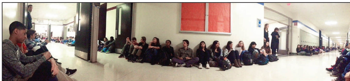
A majority of ETHS's students and many staff members lined the three miles of hallways to protest against racial injustice.

This winter, ETHS students showed their deep concern about the riots in Ferguson, MO, and Staten Island, NY, over the non-indictment of police officers that fatally shot two African American males. But, rather than taking to the streets, as in so many other communities, they came together to hold a sit-in, throughout the school, to silently express their convictions.