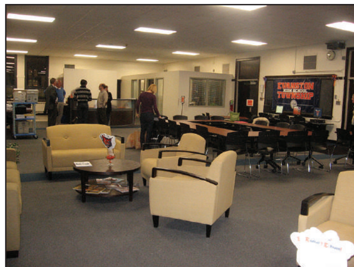
Last fall, ETHS opened the Welcome Center (above) for parents and visitors, and The Hub (Student Success Center) (below) for students. Both facilities consolidate adult- and student-centered needs into one space.

Key ETHS personnel and student leaders helped design The Hub. They soft-launched the center last fall to allow students to familiarize themselves with what The Hub offered. Once it took off, students flocked there throughout the day. Mondays are busiest, but 1,200 students on average utilize The Hub each day.