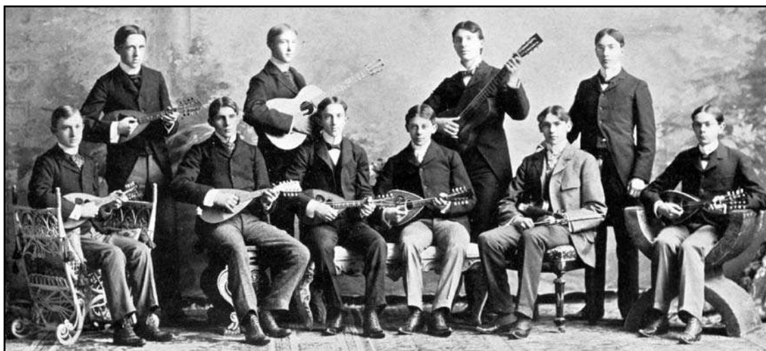
ETHS Mandolin Club, 1897