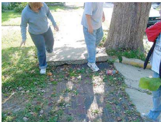
Uneven and missing sidewalk sections interfere with mobility