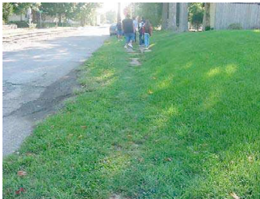
Grass has overtaken our sidewalks

It was a beautiful spring day, and the Physical Education teacher was preparing to take the middle school Adaptive Physical Education class for a walk. The students enjoyed the first block of their walk, seeing the swaying trees and colorful flowers, feeling the warm sunshine and smelling the freshly cut grass. However, their enjoyment was short-lived. The students soon encountered several problems for their classmates who depended on wheelchairs for mobility. Sidewalks in all directions from the school were broken by large, knotted tree roots jutting through them; grass and weeds covered large sections of the sidewalk; and bushes and parked vehicles intruded over the pathways. This quickly ended the excitement for the students who had looked forward to being outside on the first nice spring day.