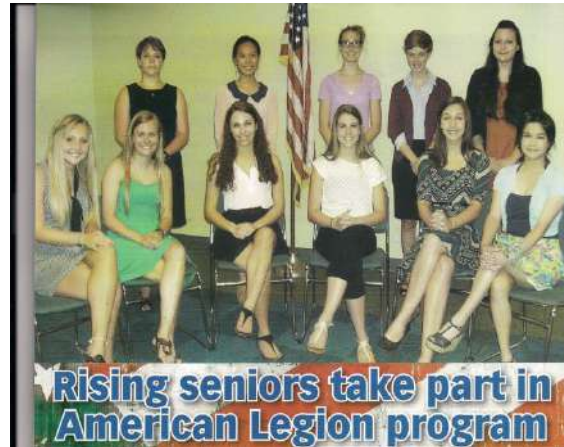
Rising seniors take part in American Legion program

Sixteen boys and 12 girls from Forsyth County were selected to take part in a prestigious government education program this summer.