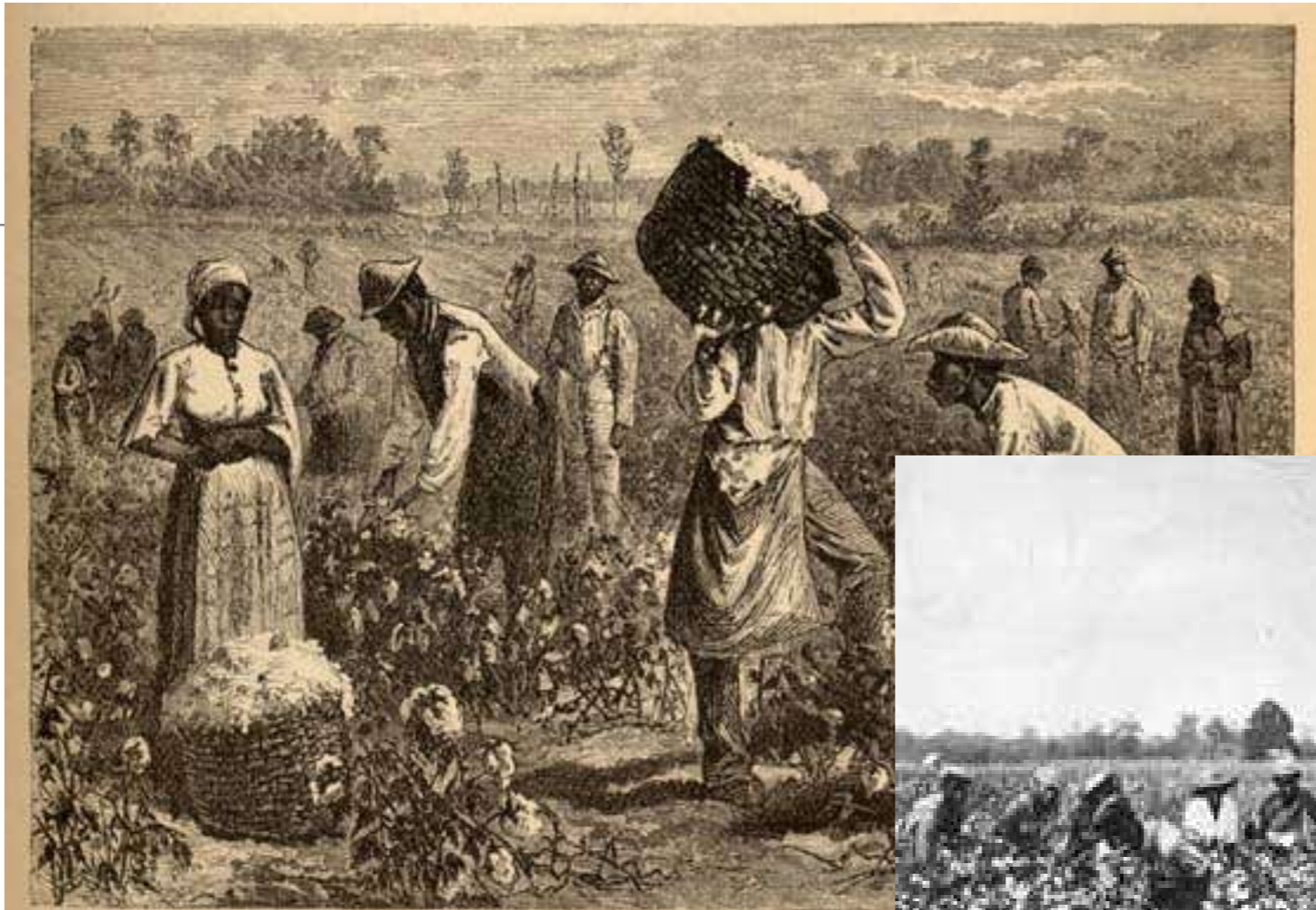
Scene on a Cotton Plantation.