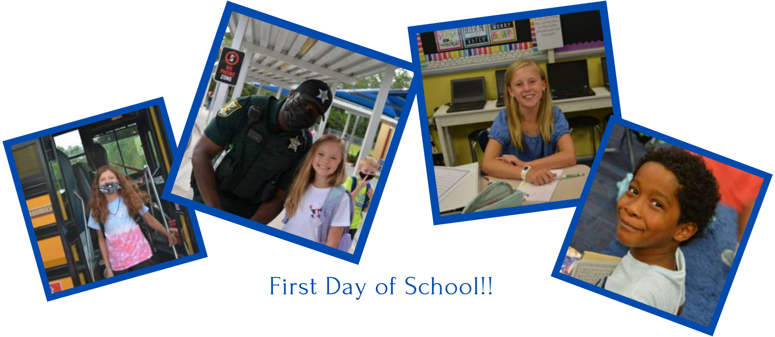
First Day of School!!