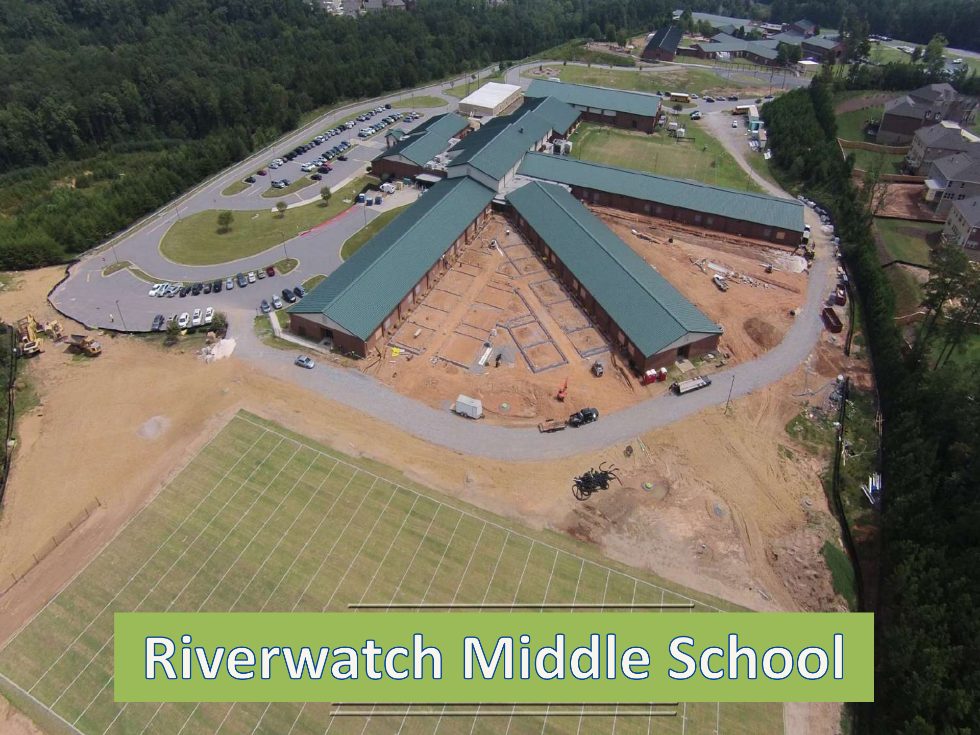
Riverwatch Middle School