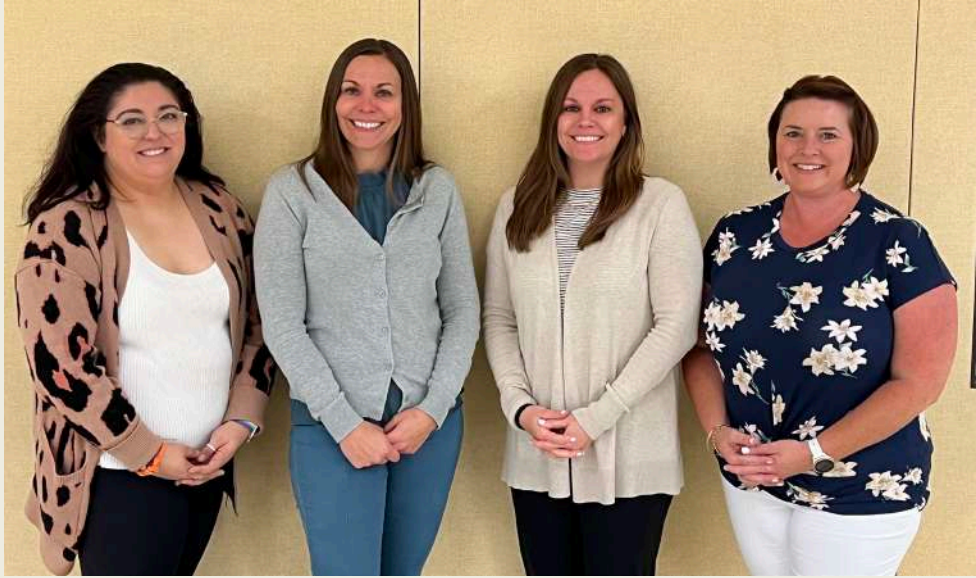
English Language Arts