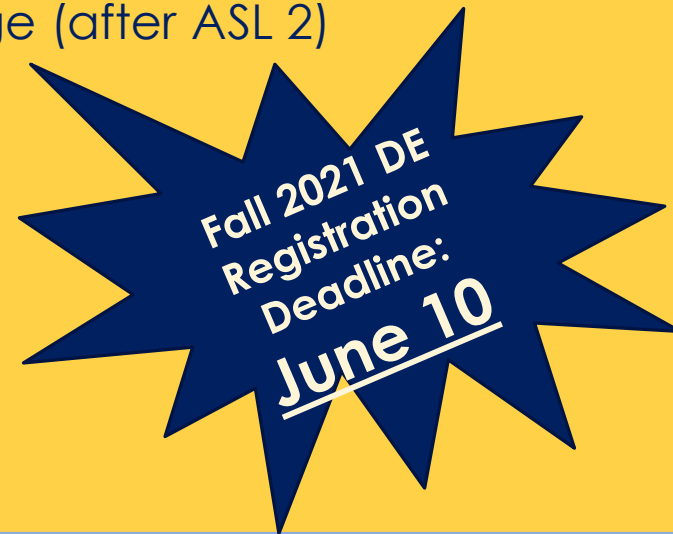
Qualifying Placement Test Scores for Dual Enrollment at SJRSC