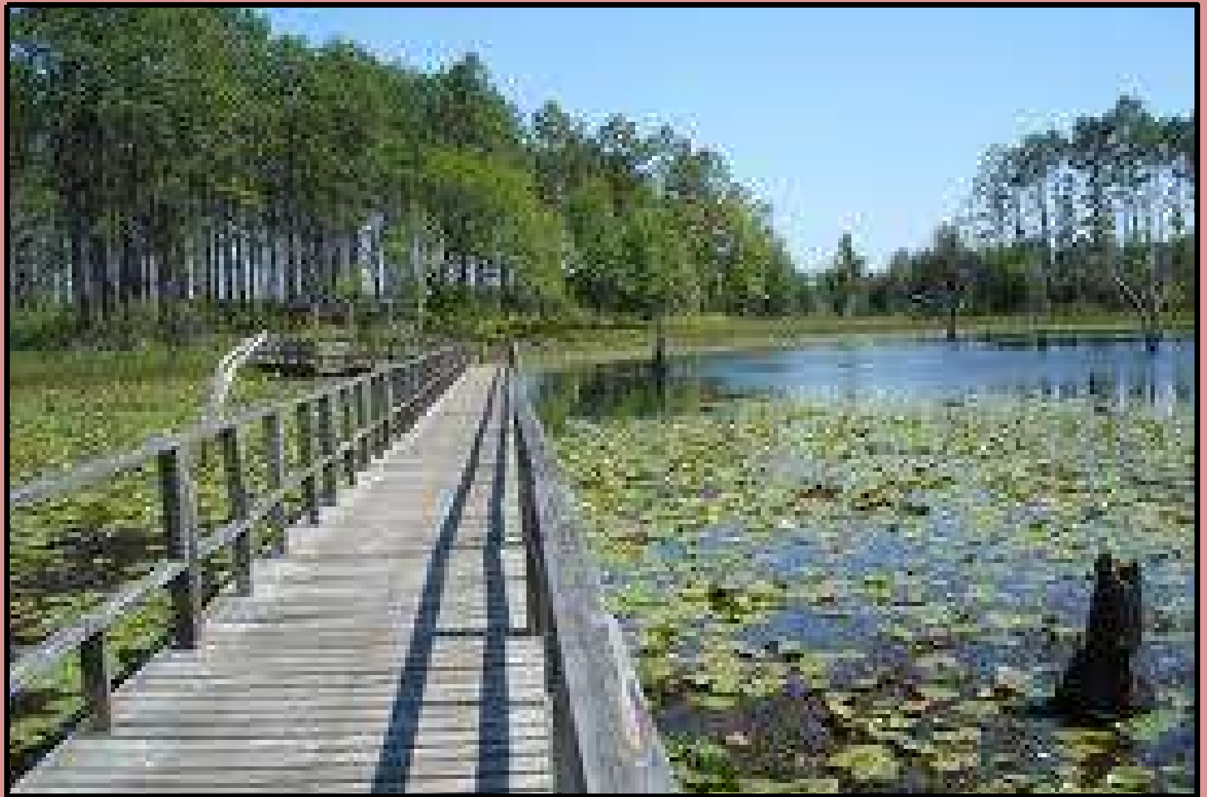
Seminole State Park