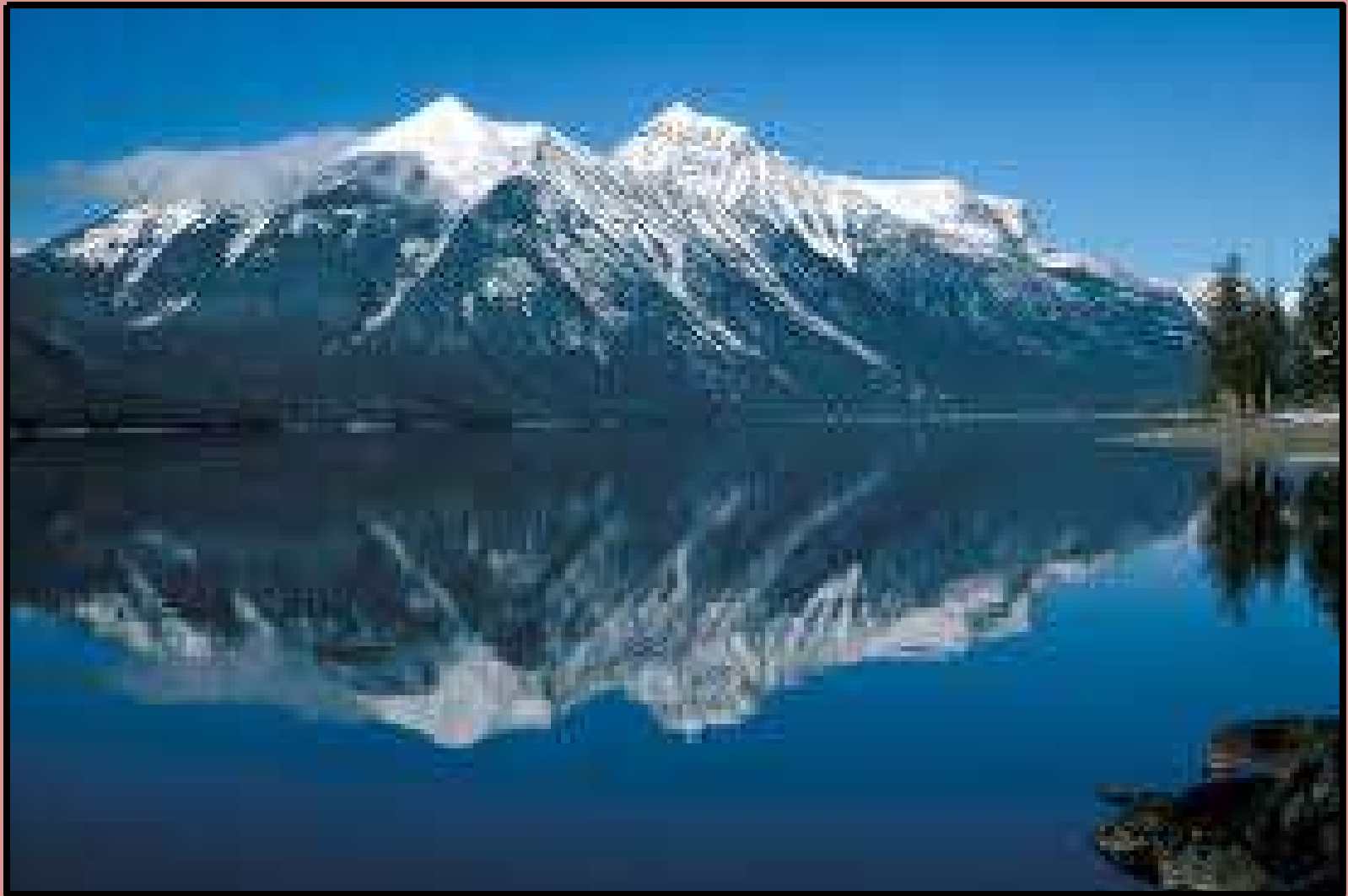
Glacier National Park