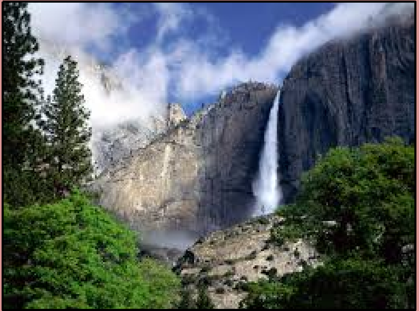
Yosemite National Park