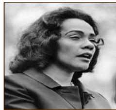
Coretta Scott King graduated from Antioch with a B.A. in music and education and won a scholarship to the New England & Conservatory of Music in Boston, MA. Just like Coretta, our girls are college bound!

ELA7W2.f. Follows an organizational pattern appropriate to the type of composition.