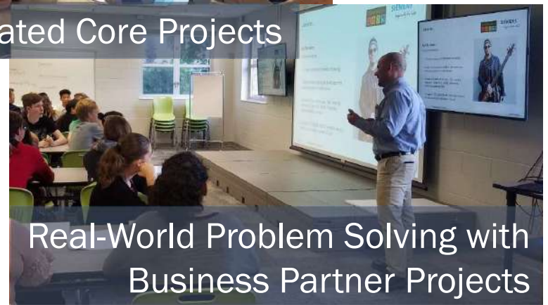
Real-World Problem Solving with Business Partner Projects