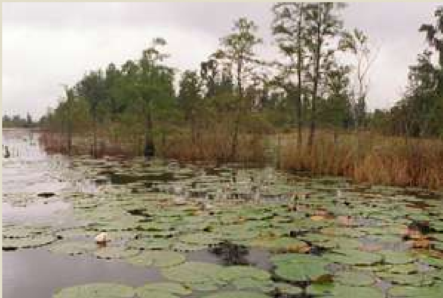
Dark waters of the Okefenokee Swamp