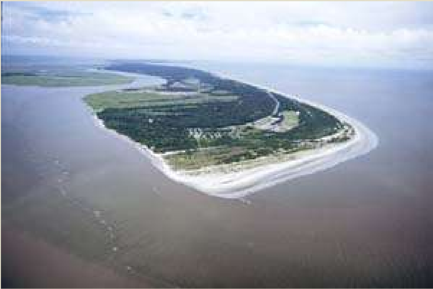
Jekyll Island - one of Georgia's barrier islands