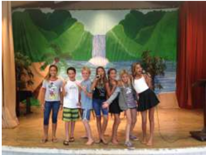
Student Council Members rehearsing for the Quarter I Student of the Week Assembly