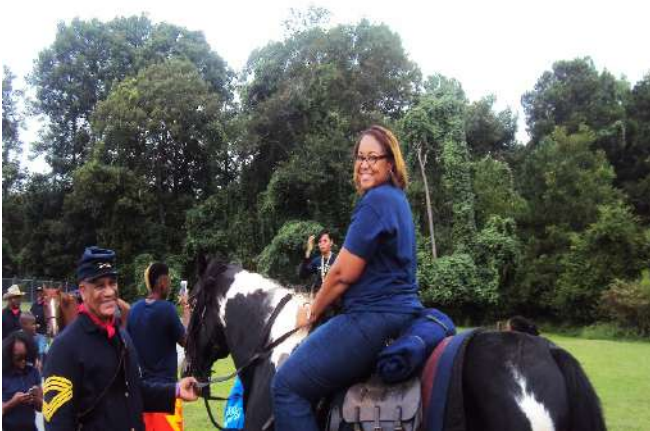
North Clayton Middle School!

http://www.clayton.k12.ga.us/departments/studentse rvices/studentdiscipline/feedback/