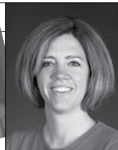
BY MEGAN ZAJAC, CLASS OF 1992