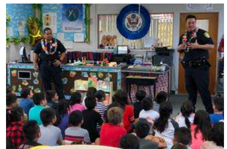
Gr. 1 with HPD Officers for “Say Hi” Visit

Thank you for supporting your child with time and accessibility to iReady reading and math at home. Thank you also for looking through your child's Take Home Folders and signing their planners daily. These practices help to support their progress, growth and independence.