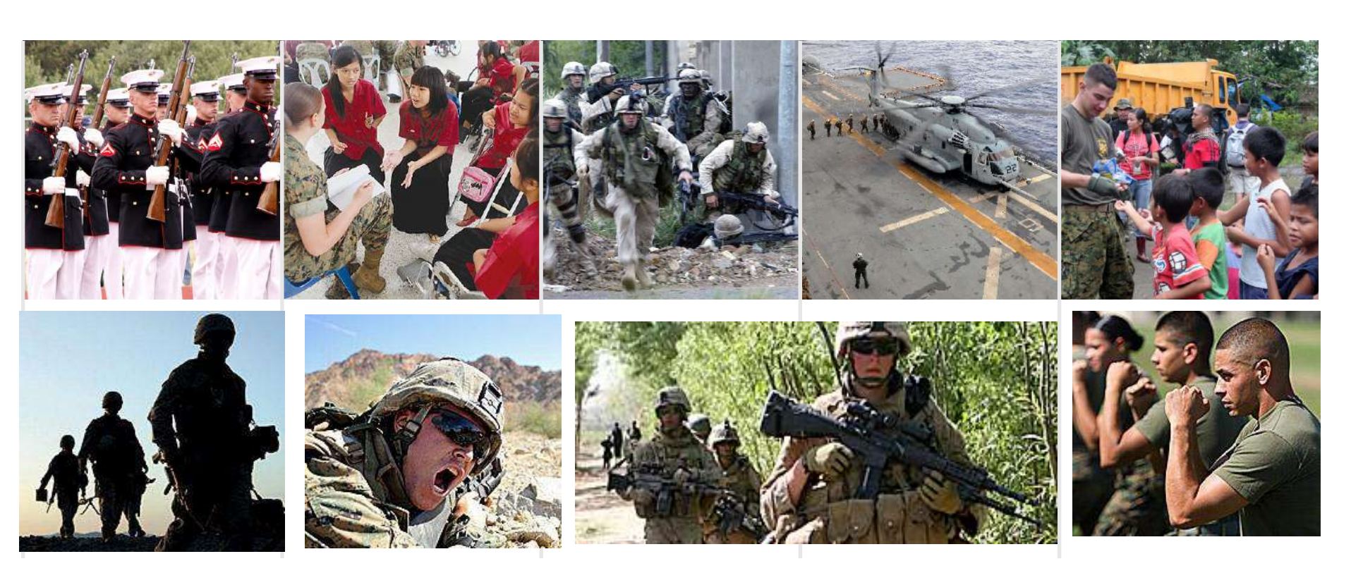
What do you think?