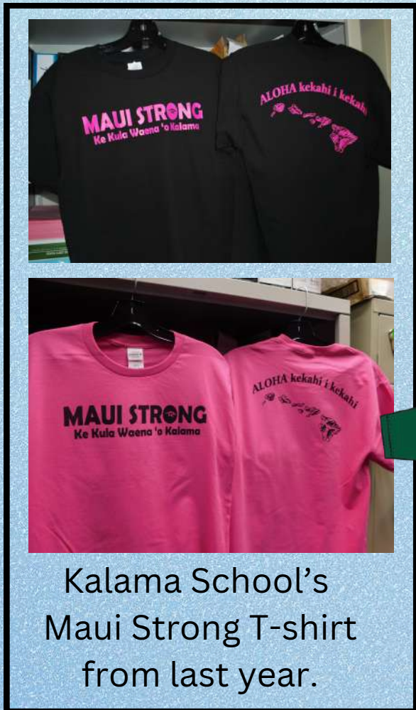
Kalama School's Maui Strong T-shirt from last year.