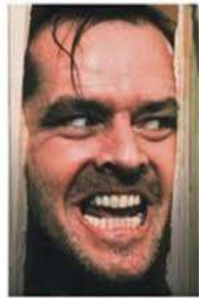
STANLEY KUBRICK'S THE SHINING