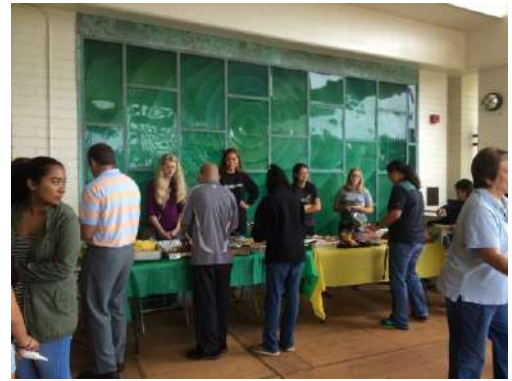
Teacher Appreciation Luncheon