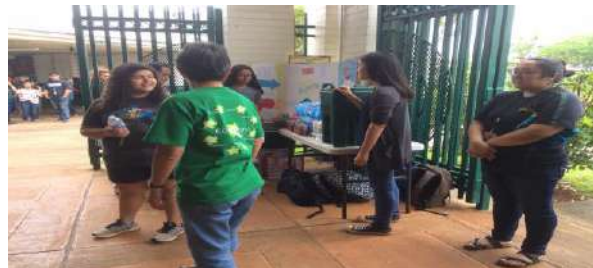
Key Club and National Honor Society

Dole Plantation Starbuck's Mililani Dots Restaurant Peterson Farms