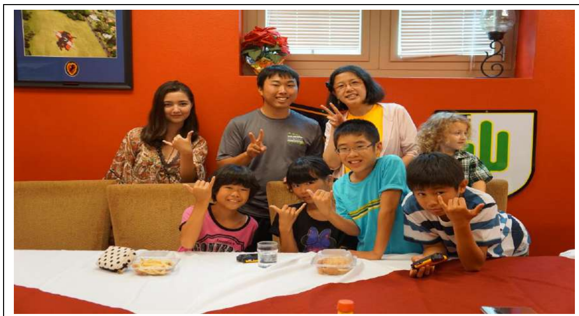
Students from Leilehua High School used their Japanese speaking talents as interpreters to help out our military partners, 2/27 Wolfhounds. The Wolfhounds were hosting 4 children from the Holy Family Orphanage in Osaka, Japan.