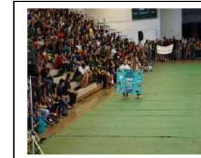
National Honor Society