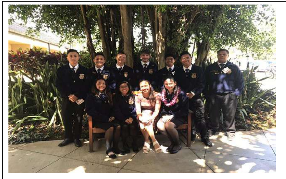
The FFA students spent 3 days at competition in Kauai. Great job to all who qualified to go!!!!