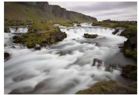
Kuhao Fisher Cummings- Iceland Bath