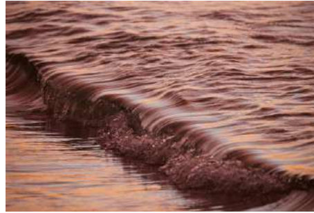
Kuhao Fisher Cummings- Copper Wire