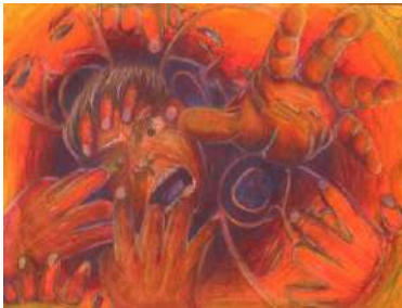
Raven Demmert- dragged in