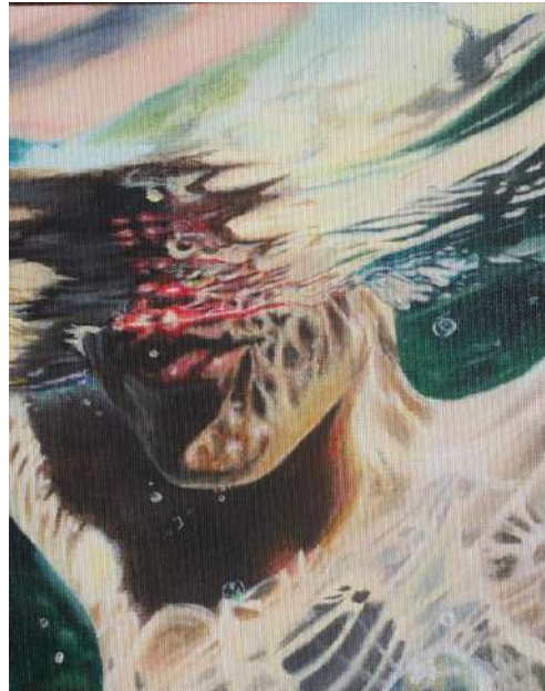
Paxton Bender- Fozzie