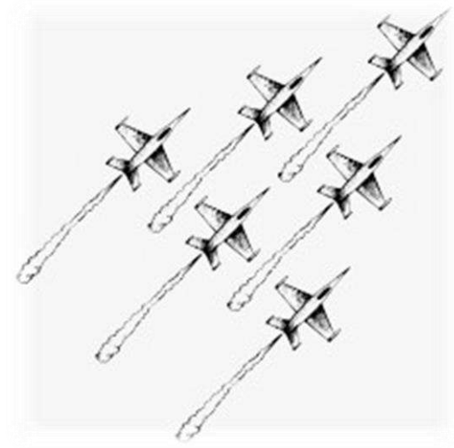
F/A - 18 Hornets