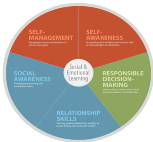
Social & Emotional Learning Core Competencies

The MindUP™ Program fosters the “6 C’s” of academic success and emotional wellbeing for the 21st century student: