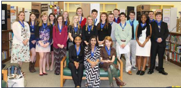
Eighteen projects and 28 students from TCCHS are advancing to National History Day State Competition.