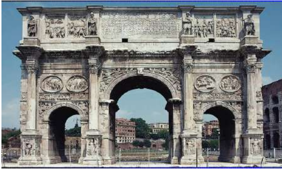
Arch of Constantine, built in 315 AD