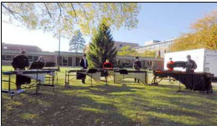
Students in the Percussion Ensemble played their concert outside the music department in the fall.

faces. Locations include the beach, in front of the former movie theatre, etc.,” he added. “We cast 30, plus 12 each orchestra/dance, 16 kids on YAMO board, and 25-30 doing some sort of technical theatre work.” The show will be put up on YouTube in mid-May.