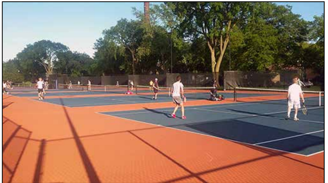
ETHS tennis team members filled seven courts of doubles in two fundraisers to benefit schools in Malawi so the students can have food all year and through future droughts.