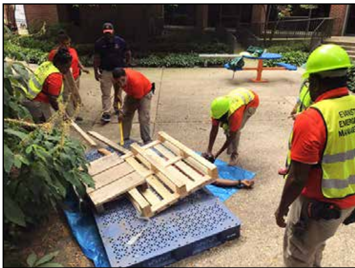
The Safety Staff receive training for cribbing (above), a technique used to free people who have been buried under fallen debris. (Below) They are also trained in teams on how to put out a fire.