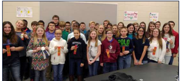
Pictured are the Thomas County Middle School Science Fair winners with their awards and ribbons.

The Thomas County Middle School Science Fair was held in December. More than 200 projects were entered by sixth, seventh, and eighth grade students. Winners will compete in the Region Science Fair at ABAC on February 12.