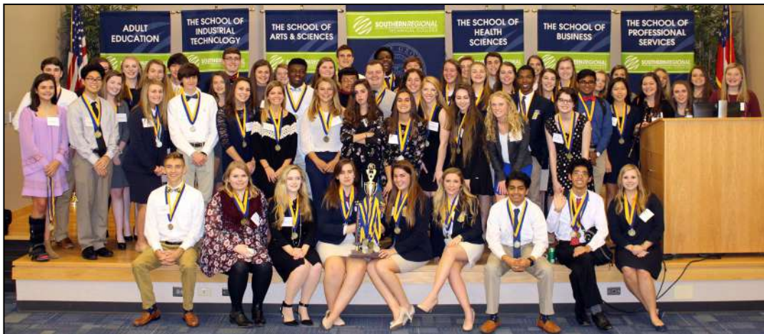
TCCHS FBLA chapter retained its region title for the sixth consecutive year. The club won top honors over 25 other counties in the FBLA Region 1 Leadership Conference and Competition held in Moultrie.

Thomas County Central High School's Future Business Leaders of America chapter continues to dominate its region's competition.