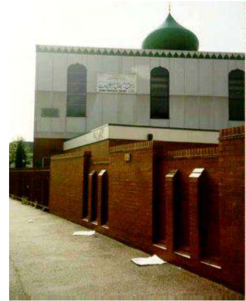
Jamia Mosque in Derby England