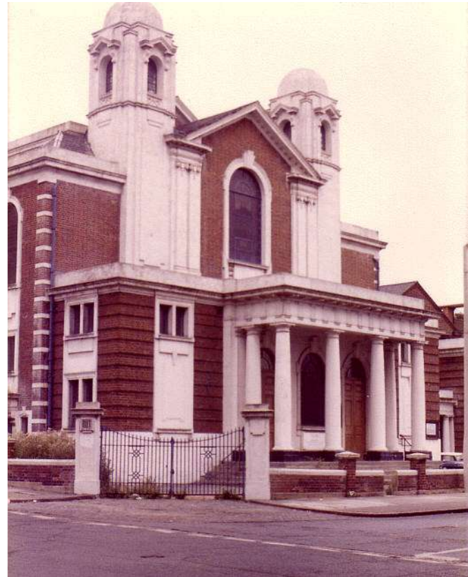
Stamford Hill, London