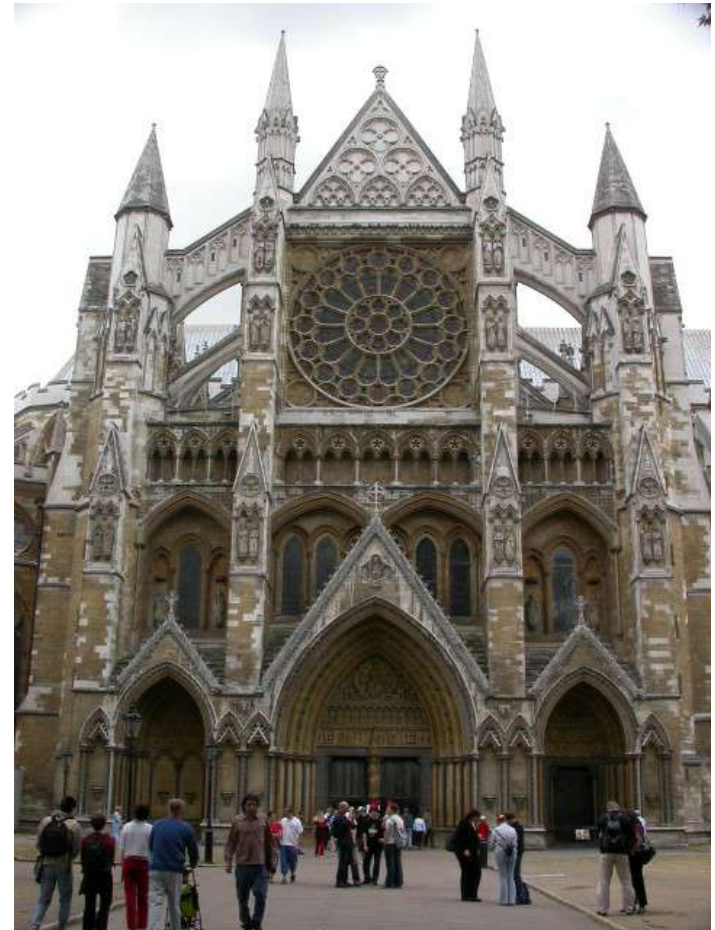
Westminster Abbey London