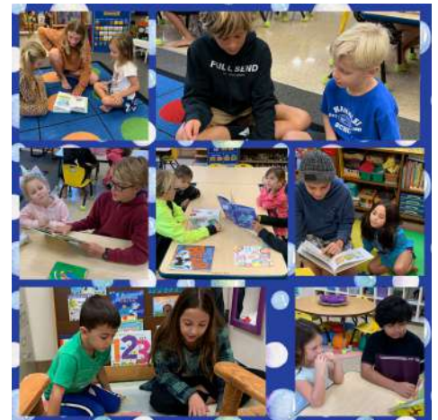
Kindergarteners with their 4th and 6th grade reading buddies