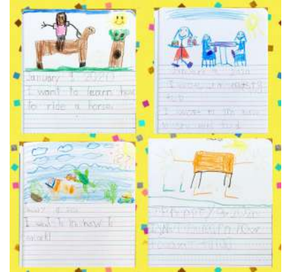
Mrs. Deblin's class is setting goals for 2020 and fine-tuning their writing and drawing skills!