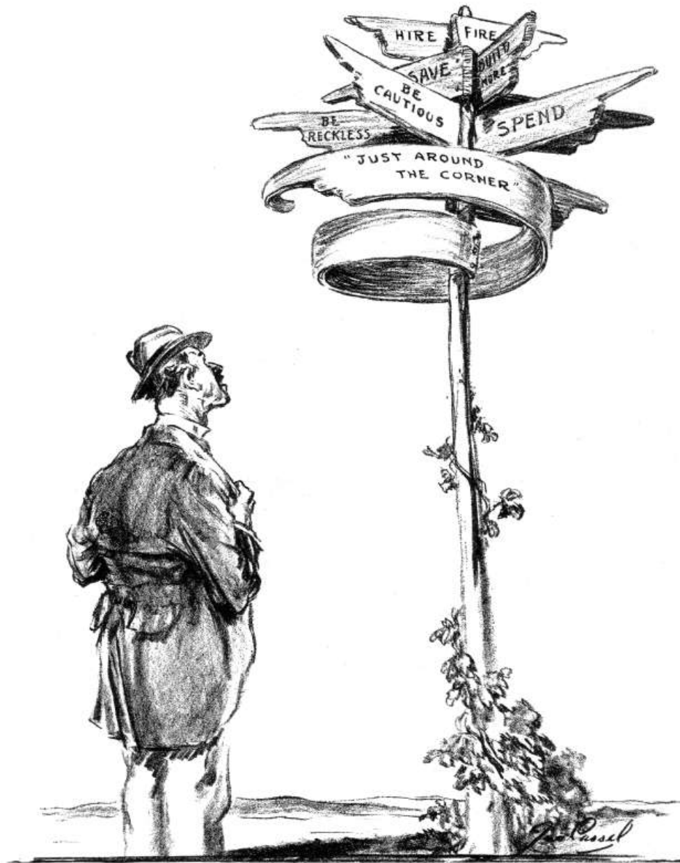
THE WAY TO PROSPERITY.

4. According to this 1931 cartoon, what are three different ways the man should follow to achieve prosperity?